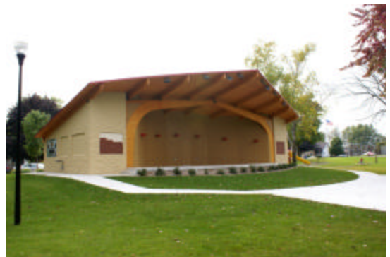
BAND STAND—OOSTBURG, WISCONSIN