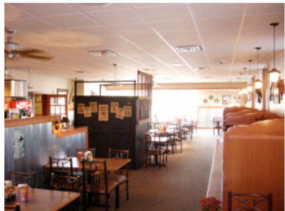
PIZZA RANCH—OOSTBURG, WISCONSIN