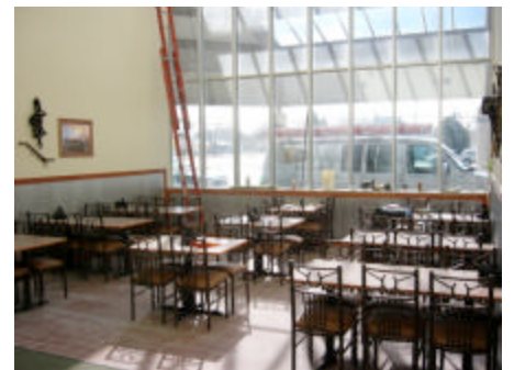
PIZZA RANCH—WAUPUN, WISCONSIN