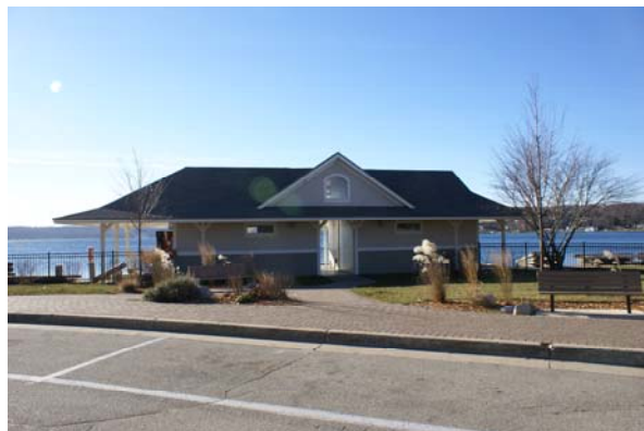
BEACH HOUSE—WILLIAMS BAY, WISCONSIN