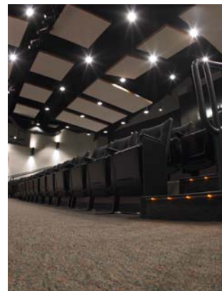
KEWASKUM HIGH SCHOOL—KEWASKUM, WISCONSIN